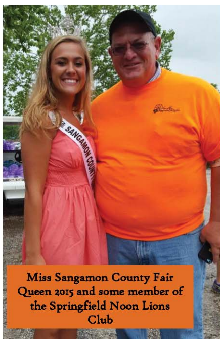
Miss Sangamon County Fair Queen 2015 and some member of the Springfield Noon Lions Club