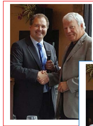
Changing of the guard