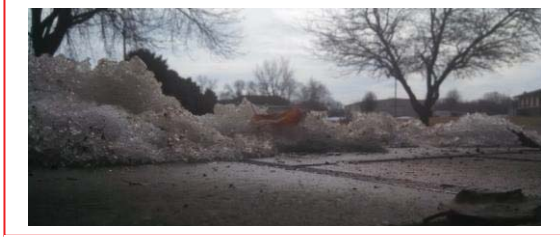
Current photo of snow pile at White Oaks Mall – All bets are down!